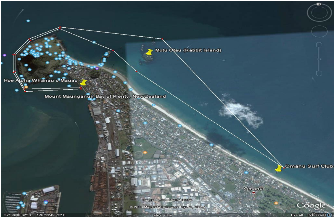
Option 1 - W1/W2/W3/J19/Novice 10km Course – Pilot Bay to Motu Otau Return